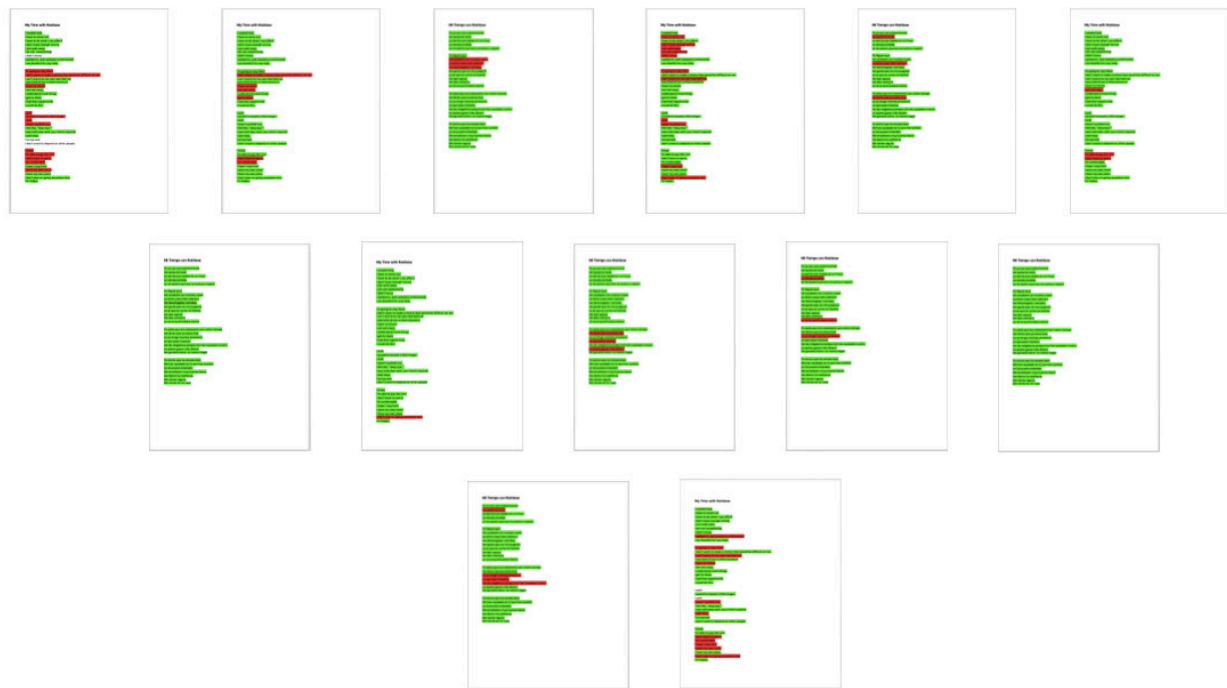
Figure 2. I-poems as coded by member checking participants.